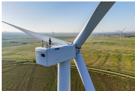
Wake effect studies