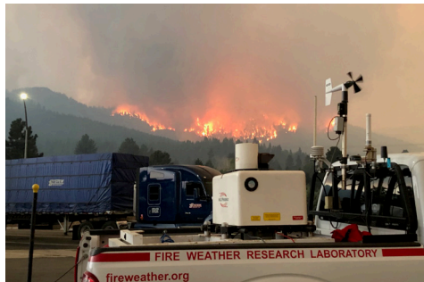
Climate and Environmental monitoring